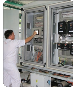
Easy access to all compartments

ChickMaster provides a complete line of products and services that meet the needs and demands of today's hatcheries.