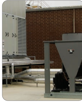
CC3-GL connection to water chiller