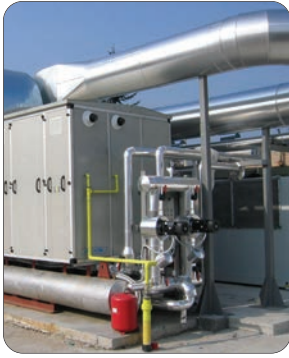
Ducts connect CC3-GL to the hatchery