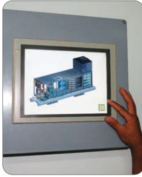
Optional remote Zeus touch screen